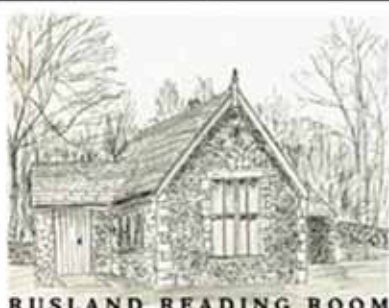
RUSLAND READING ROOM